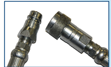
Three sets of Quick Connects, with dust caps, are included.