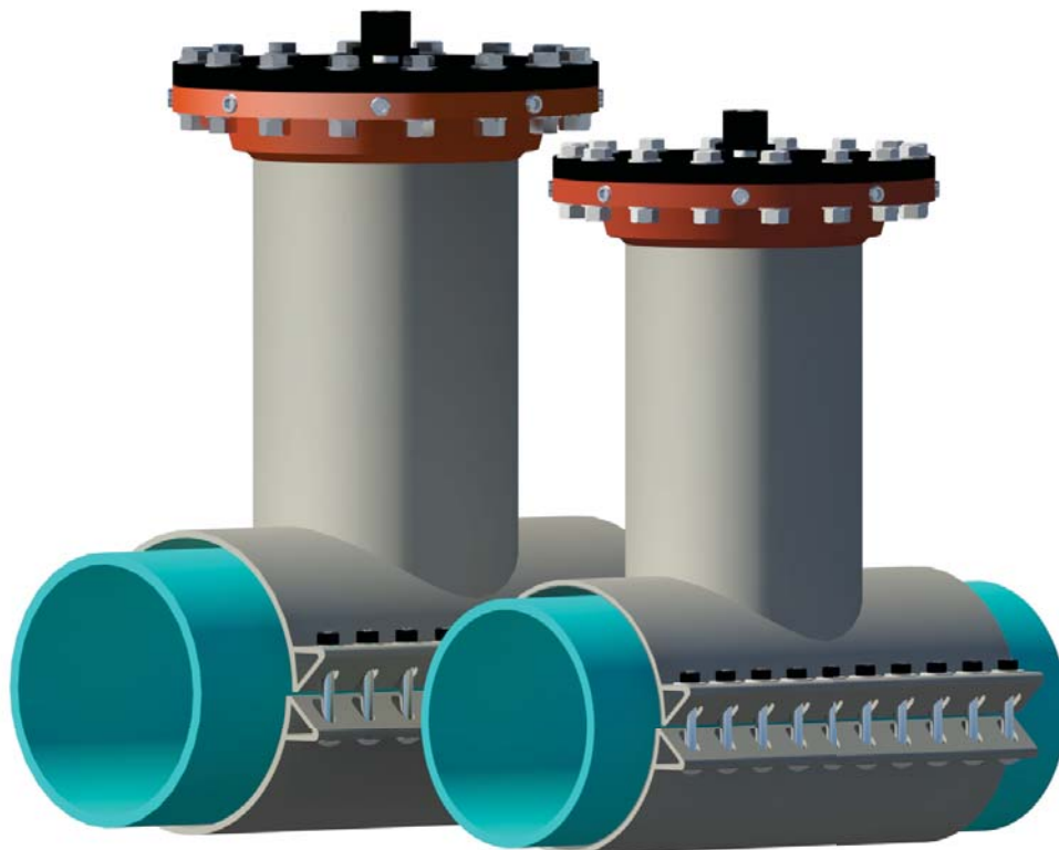
16" IVP 250